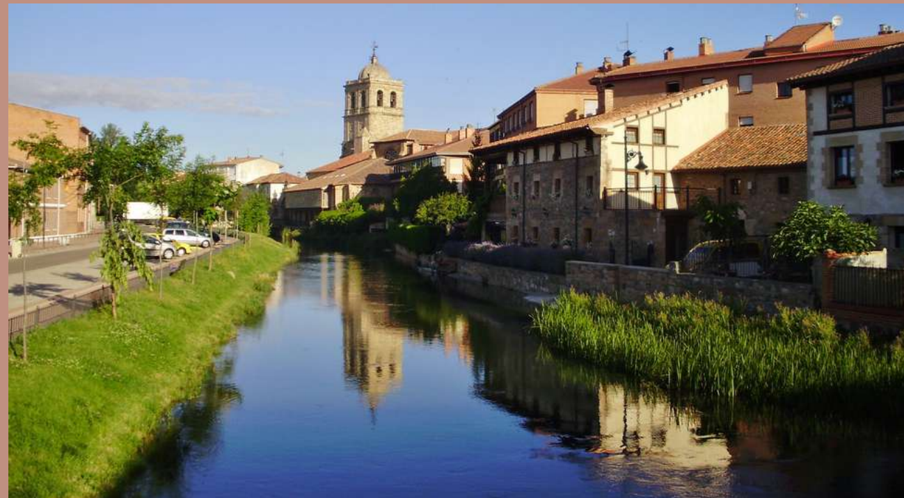
Aguilar de Campóo